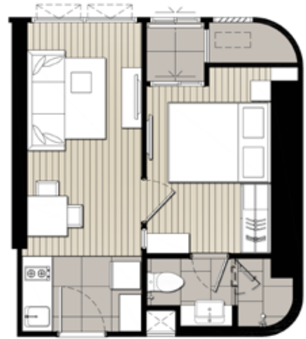
TYPE DM-1 30.50-31.50 SQ.M.