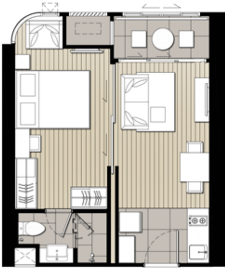
TYPE C1 35.00-35.50 SQ.M.