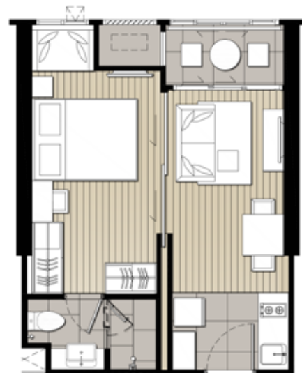
TYPE C 33.50-35.00 SQ.M.