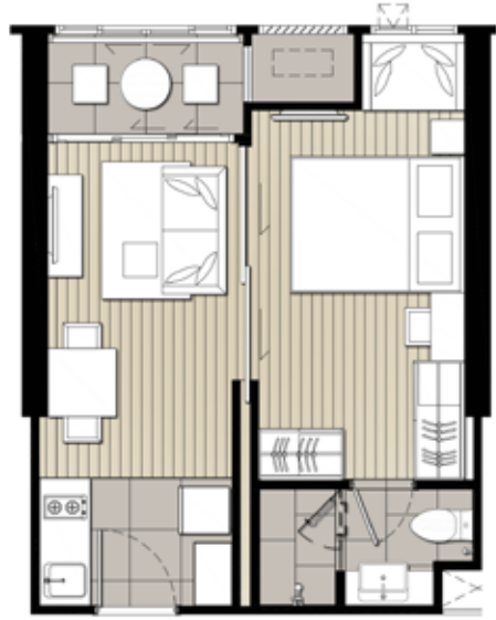
TYPE CM 33.50-35.50 SQ.M.

ROOM LAYOUTS AND PILLAR LOCATIONS ARE SUBJECT TO THE LOCATION OF THE UNIT