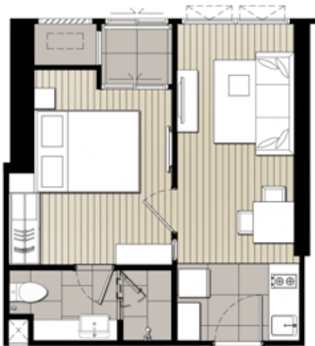
TYPE D 30.50-33.50 SQ.M.