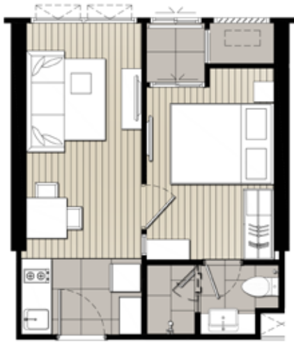
TYPE DM 30.50-31.50 SQ.M.