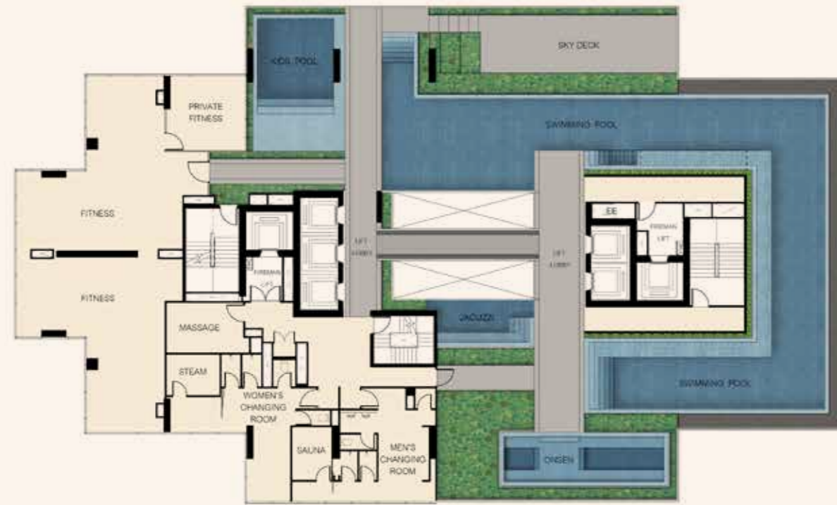
34 TH FLOOR