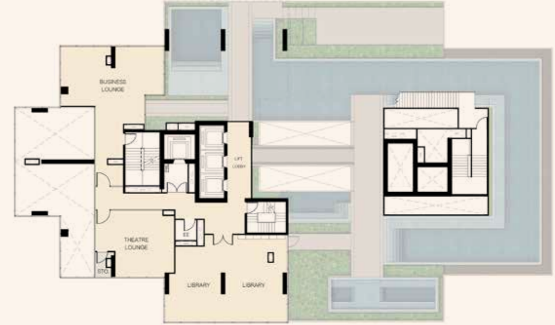
34 TH FLOOR