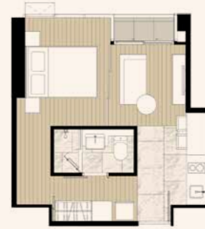
TYPE F 31.00 - 31.50 Sq.m.