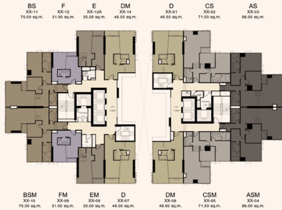
11 TH , 12 TH , 15 TH , 17 TH , 19 TH , 21 ST , 23 RD , 25 TH , 27 TH , 29 TH , 31 ST FLOOR