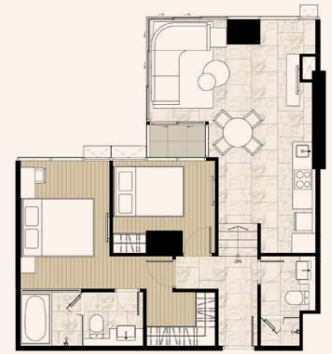
TYPE CMS 71.50 - 72.00 Sq.m.