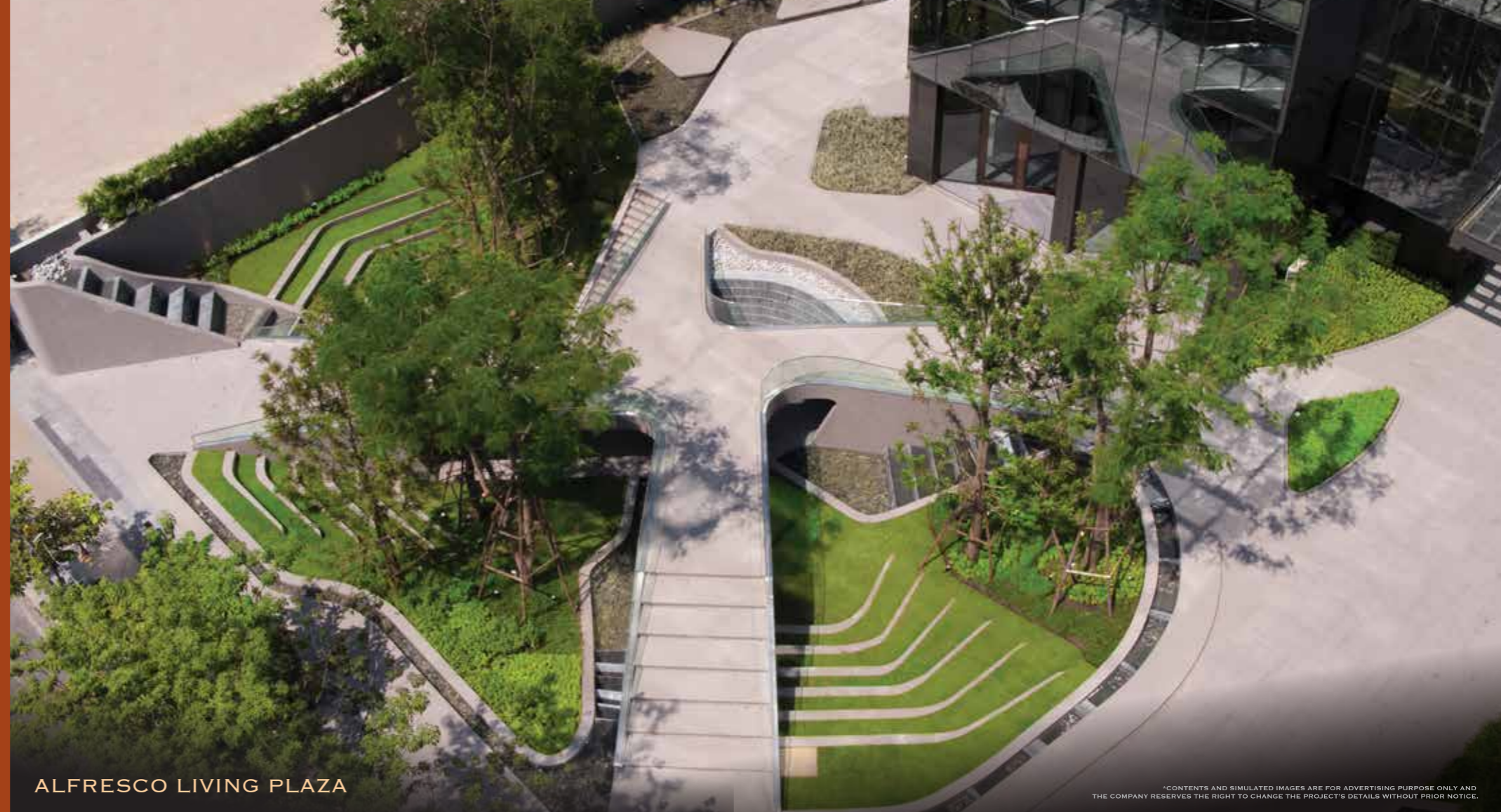
ALFRESCO LIVING PLAZA

ESCAPE THE CITY BUSTLE IN JUST A FEW STEPS AWAY VIA THE INTERTWINED CROSSOVER BRIDGE AND EXPERIENCE THE ABSOLUTE SERENITY AT THE BEAUTEOUS VERDANT SUNKEN GARDEN OR INDULGE IN A DELIGHTFUL ATMOSPHERE AT ALFRESCO LIVING PLAZA.