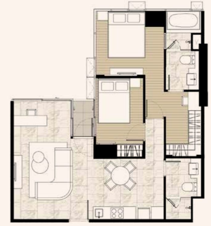
TYPE CM 71.50 - 72.00 Sq.m.