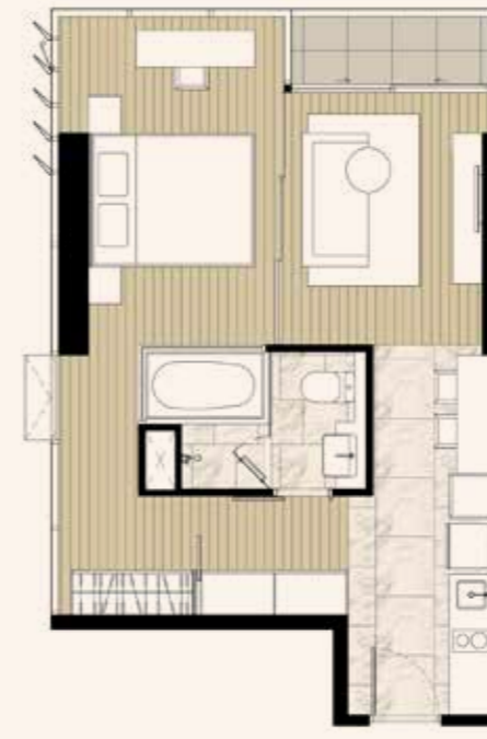
TYPE D 48.00 - 49.00 Sq.m.