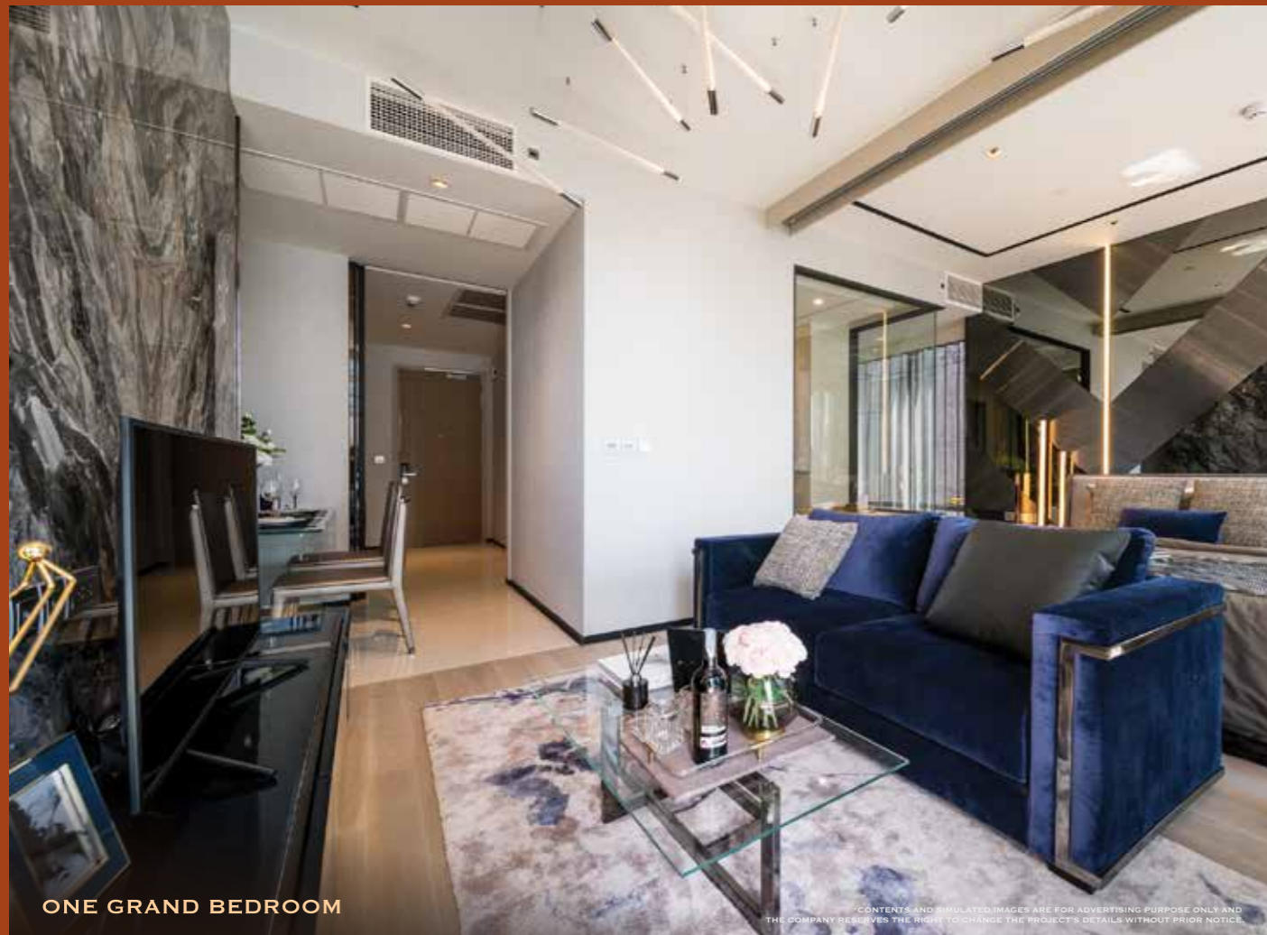
ONE GRAND BEDROOM

*CONTENTS AND SIMULATED IMAGES ARE FOR ADVERTISING PURPOSE ONLY AND THE COMPANY RESERVES THE RIGHT TO CHANGE THE PROJECT'S DETAILS WITHOUT PRIOR NOTICE.