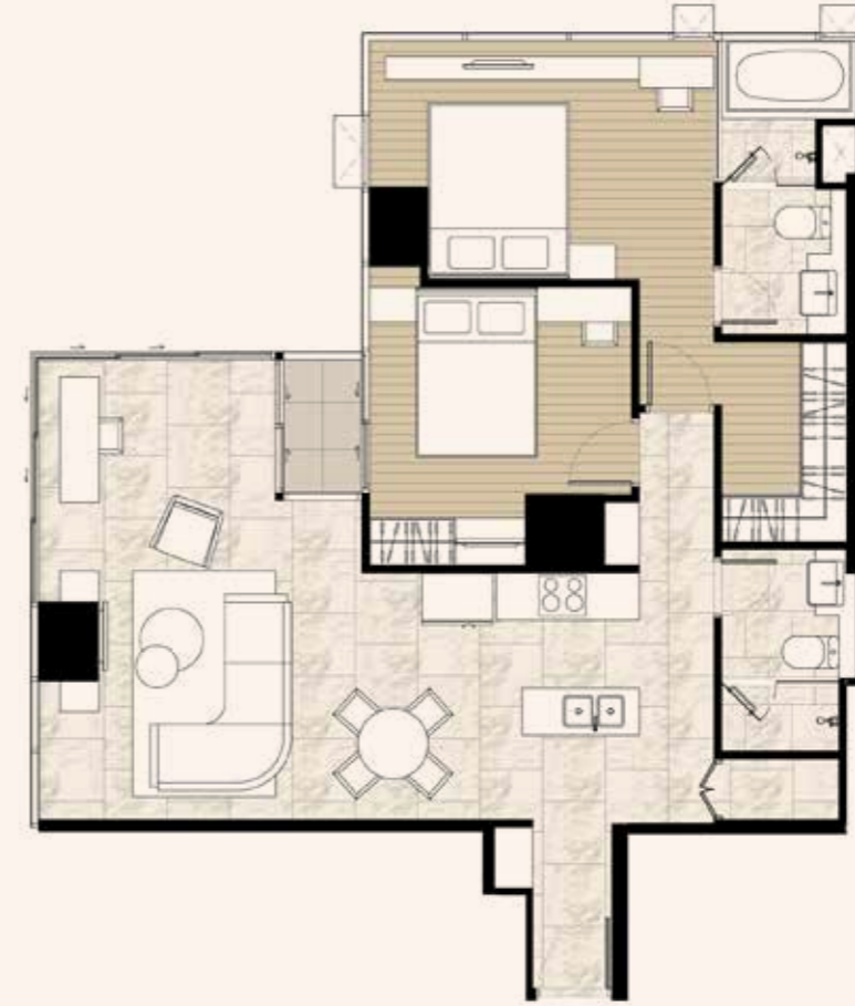
TYPE A 86.00 - 86.50 Sq.m.