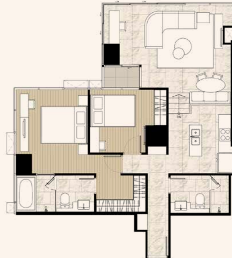
TYPE AS 86.00 - 86.50 Sq.m.