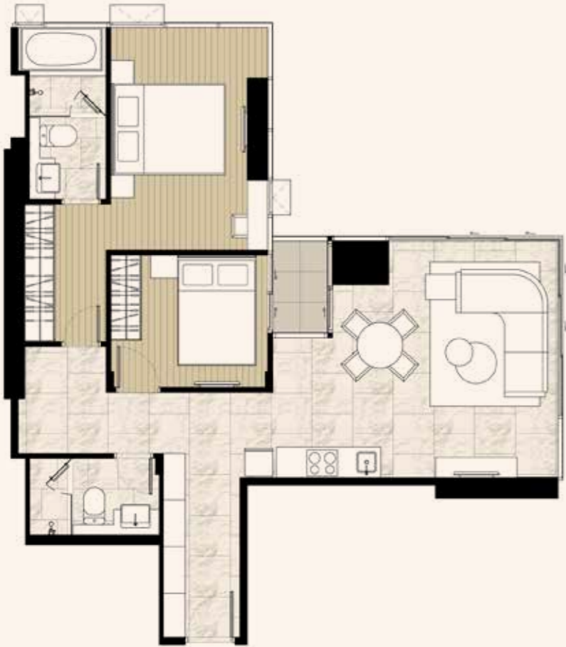
TYPE B 75.00 - 75.50 Sq.m.