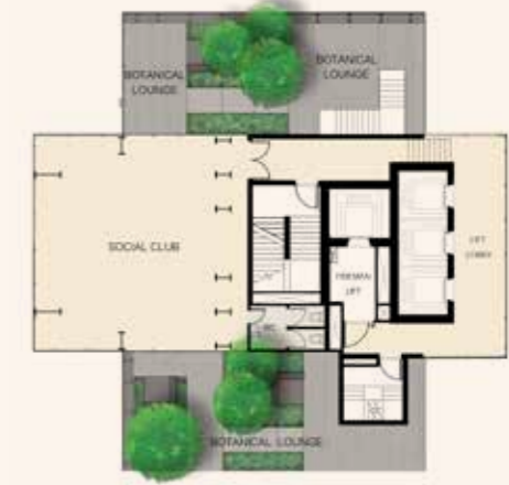
48 TH FLOOR