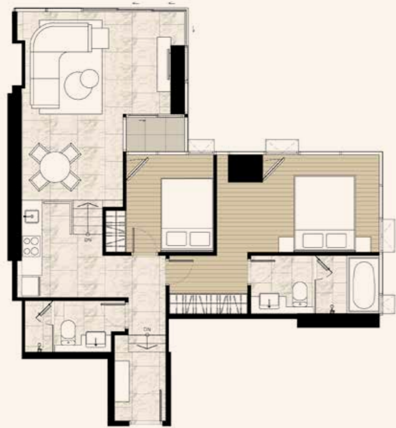
TYPE BS 75.00 - 76.00 Sq.m.